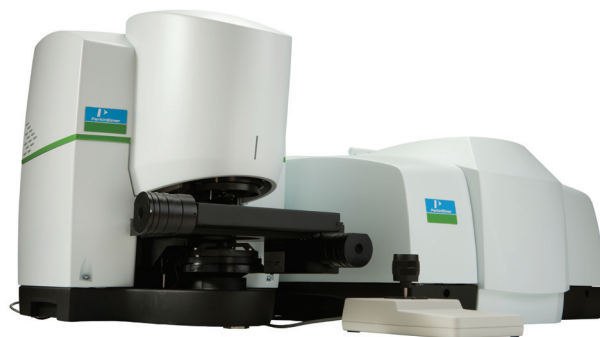
Spotlight 200 FT-IR Microscope System

All labs are different, with different detection and analysis requirements. And that's the thinking behind our complete family of microscopy solutions. Each system is engineered to the highest quality specifications, providing high energy throughput, reproducibility – and a real sense of confidence in the quality of your results.