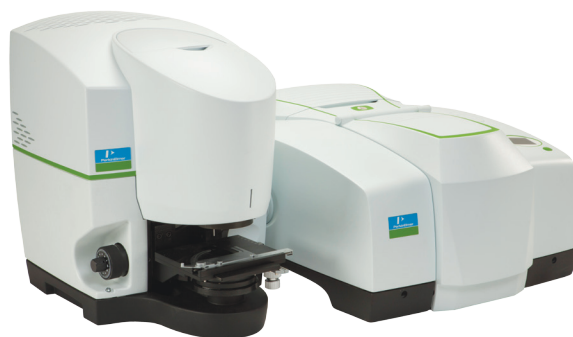
Spotlight 150 IR Microscope System

And best of all, the Spotlight 200 system is fully upgradable to the industry-leading Spotlight 400 FT-IR imaging technology.