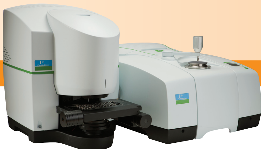
Spotlight 400 FT-IR Imaging System