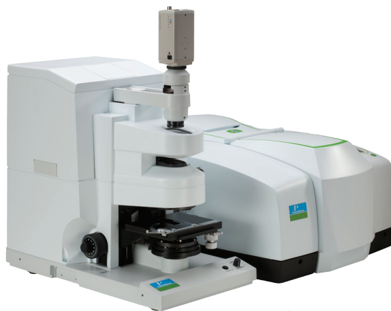
MultiScope FT-IR Microscope System

And like all of our IR products, it can remain an integral part of your infrastructure as you move ahead, with upgrade options such as a purge capability, IR and visible polarization for molecular structure studies, a heated sample holder, and micro-sampling accessories available.