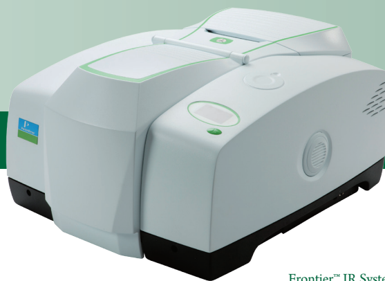
Frontier™ IR System