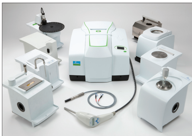
Frontier IR Accessories

And our General Purpose Optical Bench (GPOB) Accessory is ideal for situations where the standard sample compartment needs to be free for normal operation and an additional accessory has to be permanently "parked" in a second position in the instrument.