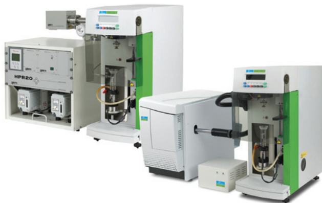
Figure 1. Pyris 1 TGA is shown interfaced to a HPR-20M (left) and a TurboMass 600 MS (right).

All of the TGA systems supplied by PerkinElmer (Pyris™ 1 TGA, STA 6000 and TGA 4000) can be easily interfaced to MS systems. PerkinElmer can supply systems with either the PerkinElmer Clarus® MS or with a Hiden Analytical MS. In this study, a Pyris 1 TGA interfaced to a Hiden Analytical HPR-20 MS was used.