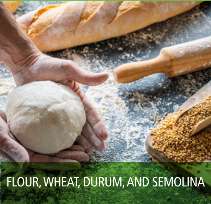
FLOUR, WHEAT, DURUM, AND SEMOLINA