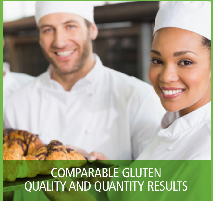
COMPARABLE GLUTEN QUALITY AND QUANTITY RESULTS