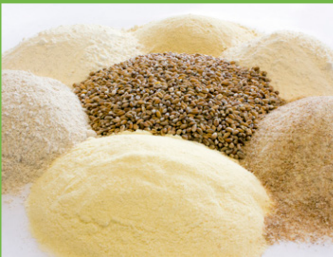
WORLD STANDARD TEST FOR GLUTEN IN FLOUR, WHEAT, DURUM, AND SEMOLINA