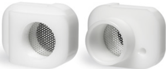
Perten Glutomatic® 2000 System Measure Gluten Quantity and Quality