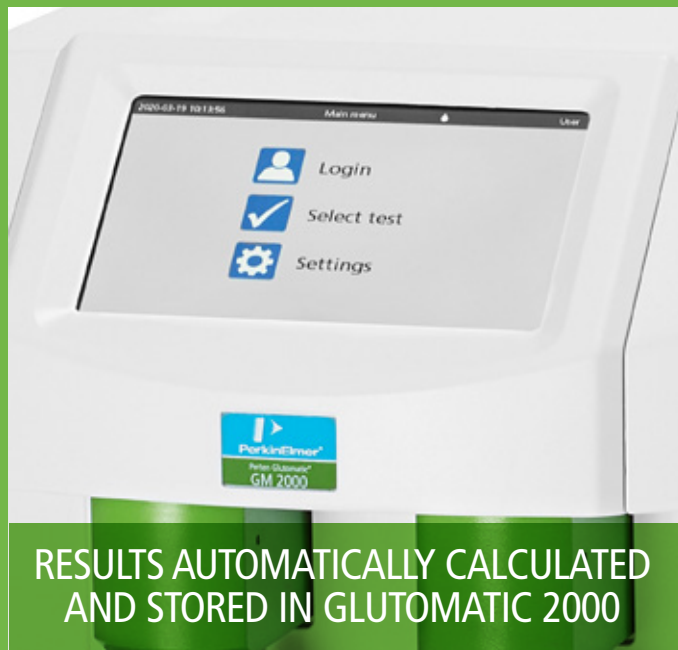
RESULTS AUTOMATICALLY CALCULATED AND STORED IN GLUTOMATIC 2000