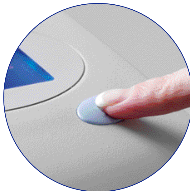
Go Button designed to increase productivity, by eliminating analysis steps and simplifying operations