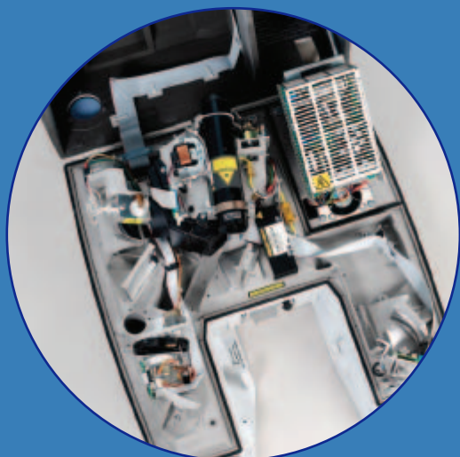
Inside the NEW Spectrum 100 Series

Increased productivity – Exclusive sampling features and intelligent software offer quick, predictable and reproducible results