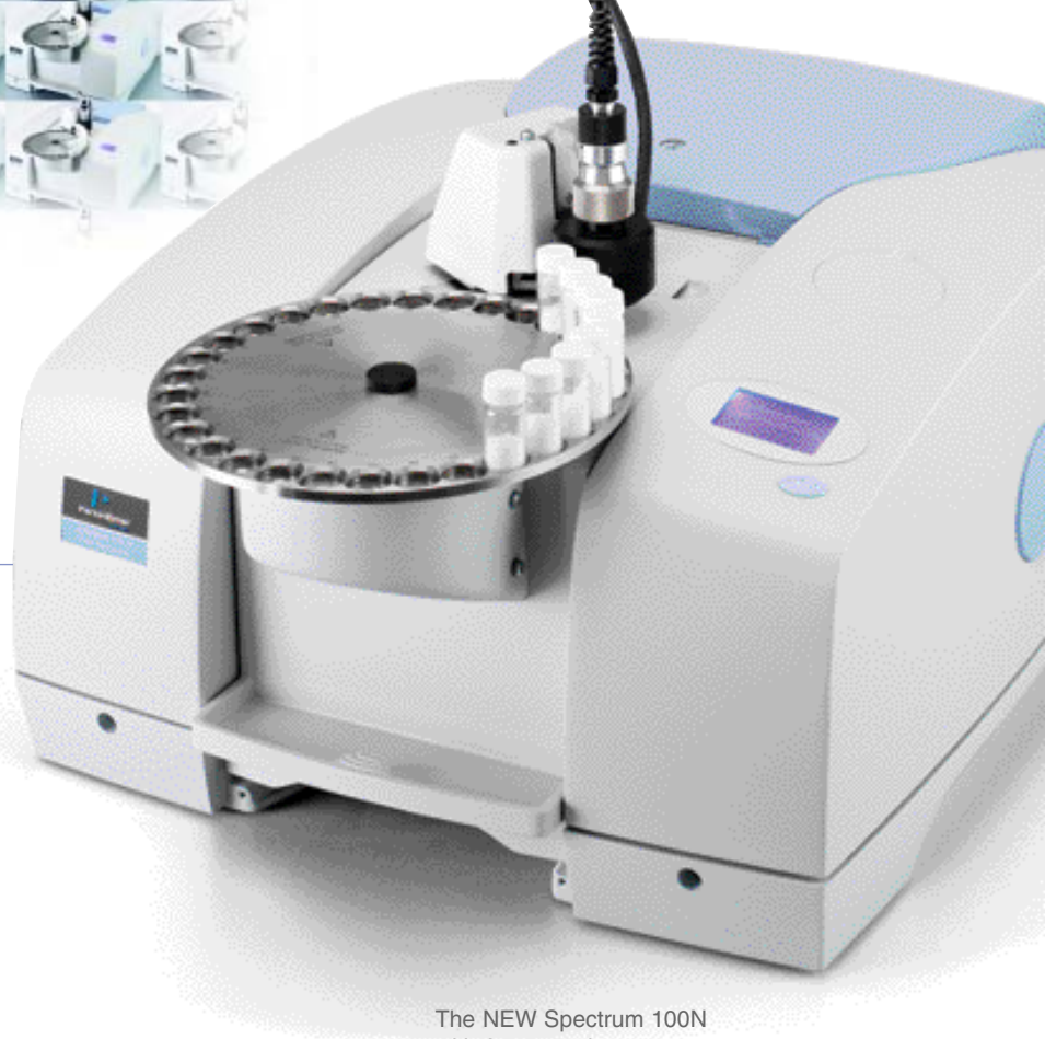
The NEW Spectrum 100N with Autosampler accessory