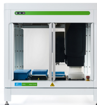
Zephyr G3 Workstation