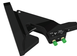
Patented light guided 50 mm flow cell.

allows for one-motion installation and exchange, enabling greater flexibility and ultimately higher productivity in your lab. To further improve your sensitivity, an optional 50 mm flow cell is available. The combination of sampling rates up to 200 Hz, low optical dispersion, and the benefits of spectral identification make the LC 300 PDA detector the perfect solution for almost any application.